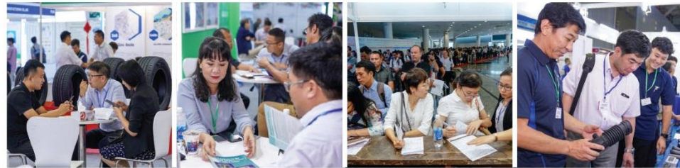
VIP Buyer Networking activities B2B Counter Booth activities