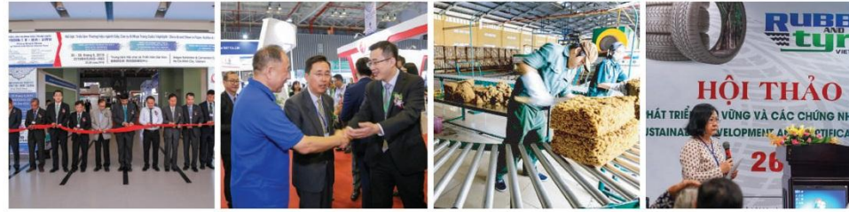
Opening Ceremony VIP tour Factory tour Seminars